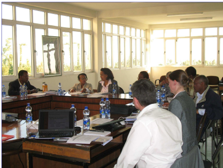
Workshop to review pesticide registration procedures in processes in Ethiopia