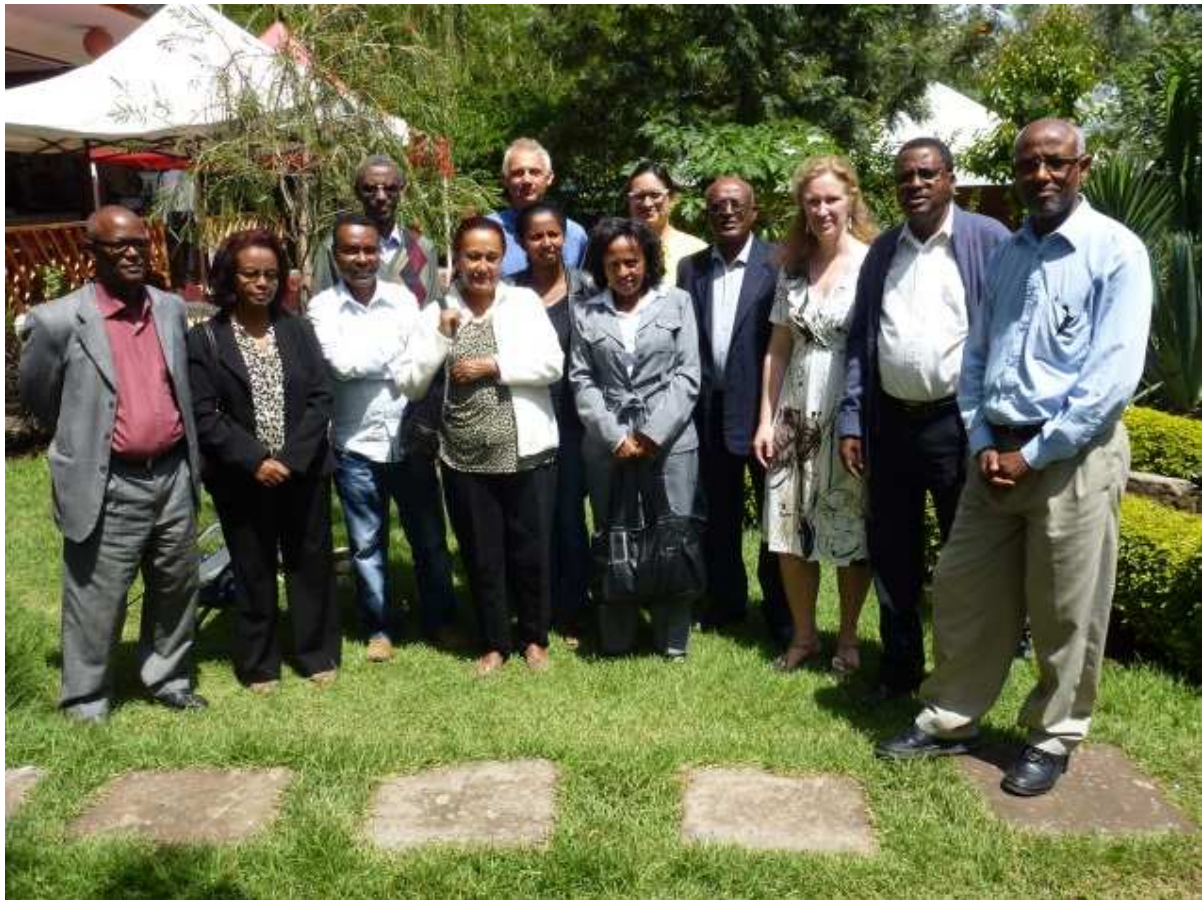
Workshop participants on proposed evaluation tested with pilot compounds